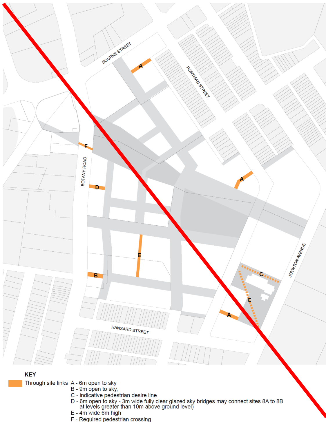
Figure 3.27 Through-site links and arcades (Existing graphic below proposed to be deleted and replaced)